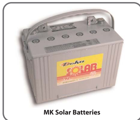
MK Solar Batteries

The Deka Solar Series of valve-regulated, gelled-electrolyte batteries are designed to offer reliable power for renewable energy applications where frequent deep cycles are required and minimum maintenance is desired. These batteries are sealed, but will vent at a pressure of 2 psi while being charged. Therefore, they require a ventilated enclosure to prevent gas build up. Maximum charging voltage should be at least 13.8 volts, but no more than 14.1 volts at 68°F. Two year warranty (One full and one pro-rated). We recommend these batteries for small to medium sized PV systems, from recreational vehicles to remote telecommunication sites.